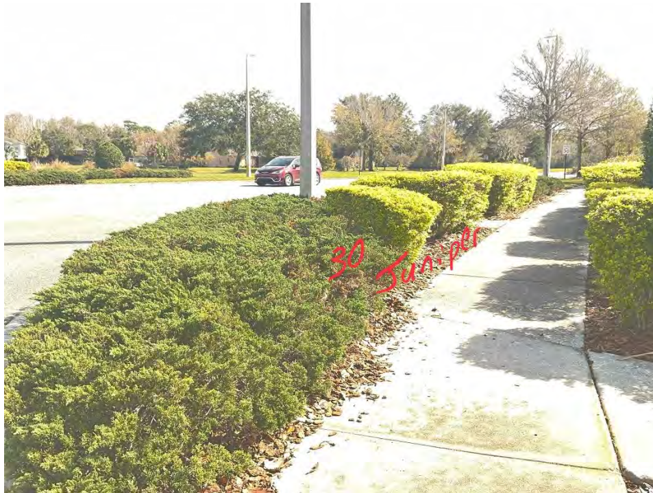
Planting bed at Sunlake Blvd. and Evergreen Oaks Dr.