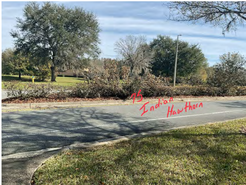
Center island south of Evergreen Oaks Dr.