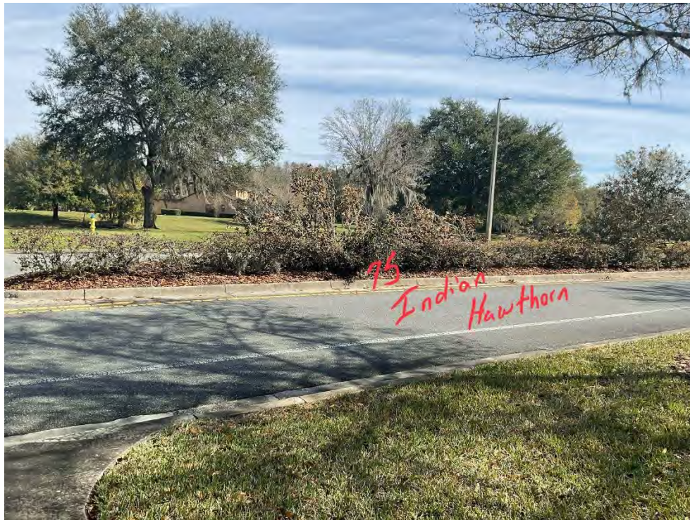
Center island south of Evergreen Oaks Dr.